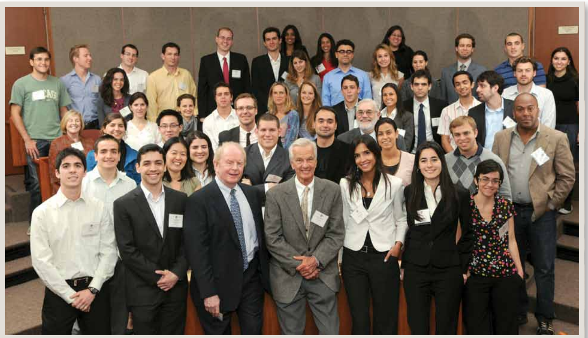
Jorge Paulo Lemann and some of the Lemann Fellows at Harvard: 304 beneficiaries since 1999.

These diverse programs are unified by a belief that investing in the outstanding individual makes a difference to society. They include graduate and undergraduate fellowships to the finest universities in the United States, special assistance to athletes and opportunities for public school students of exceptional promise, including vocational training.