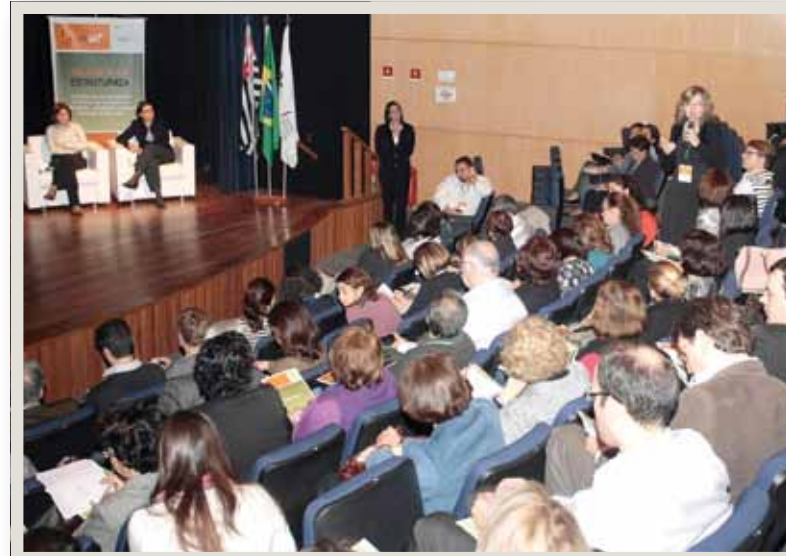
Delegates from municipal departments of education at the 2 nd Leaders in Education Management Seminar (above); presentation of the study about the impact of structured teaching systems (left); the Brazilian version of the book Teach Like a Champion , distributed free of charge to 2,500 professionals of the public education system (left page).